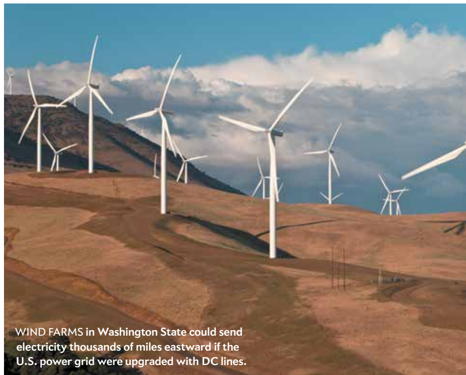
WIND FARMS in Washington State could send electricity thousands of miles eastward if the U.S. power grid were upgraded with DC lines.

NREL's modeling, for all its sophistication, also shows the enduring challenge of weather-smart design. For example, McCal-